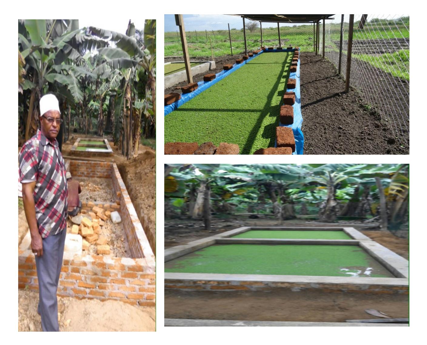
Azolla Ponds in Bunda and Bukoba Rural Districts

Azolla has been spotted in some parts of the country and therefore, ESRF with Support from the United Nations Development Programme (UNDP) have established four demonstration sites for the Azolla. Two demonstration sites were constructed in Bukoba Rural District and other two in Bunda District. Currently azolla is used in as feed supplement for fish and other animals including chicken.